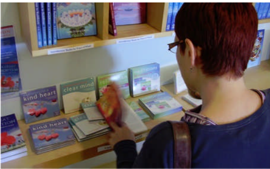
Bringing Dharma to the General Public