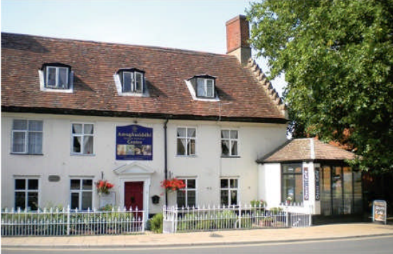
Amoghasiddhi Buddhist Centre